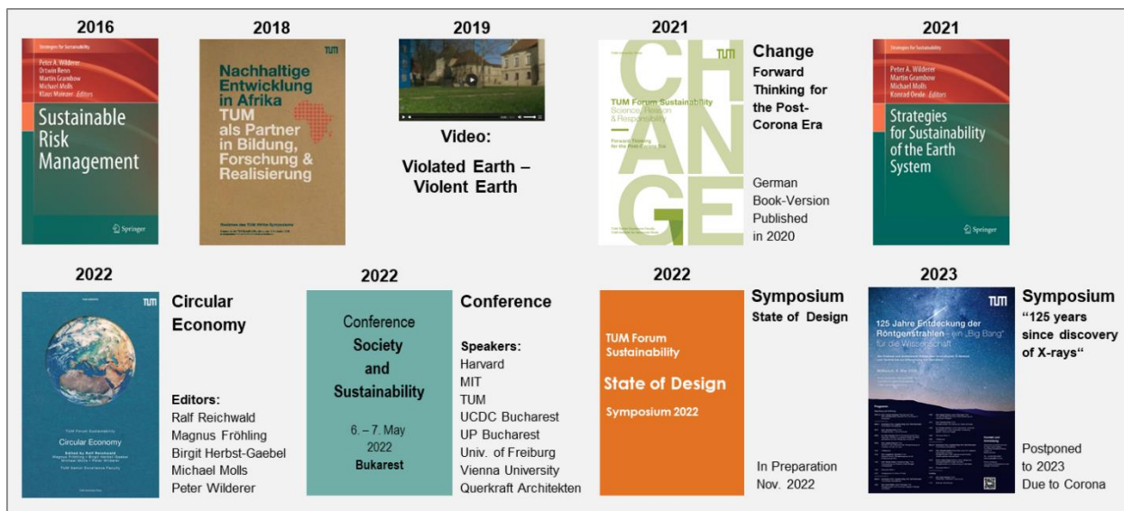
Figure 3: TUM Forum Sustainability – Symposia & Publications since 2016

Figure 3 provides an overview of SEF publications to date. The 2022 Symposium (November) is dedicated to the topic of “design.” This interdisciplinary conference will discuss the meaning and role of design and design methods in business, culture, science, and technology – sectors of society with different, sometimes opposing interests, whose decisions and activities necessarily influence each other. The goal of these discussions is to work toward a standard definition that explains what design is and can be, with its many facets, across the disciplines. A conference volume will be published in 2023. Other fora on emerging topics are already in planning.